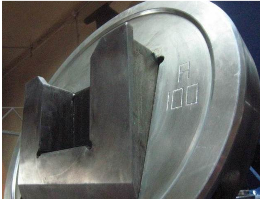
ICE-Trade Safety Chuck with disc in open position