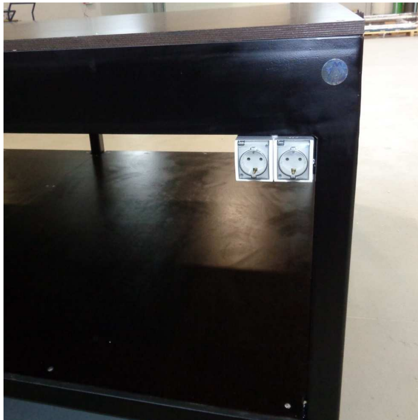
Work Bench detail with 22 mm thick work blade (multiplex plywood) and plugs for the power tools