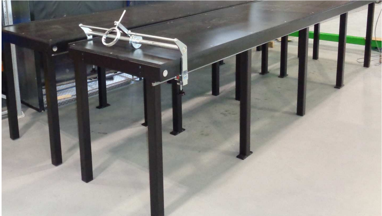
ICE-Trade Work Bench for belt width 800 mm, length 8 m (2 Parts) with side border

For the PVC belting the Work Bench below has a Hiwin Linear Guide for the installation of V-guides on the belt.