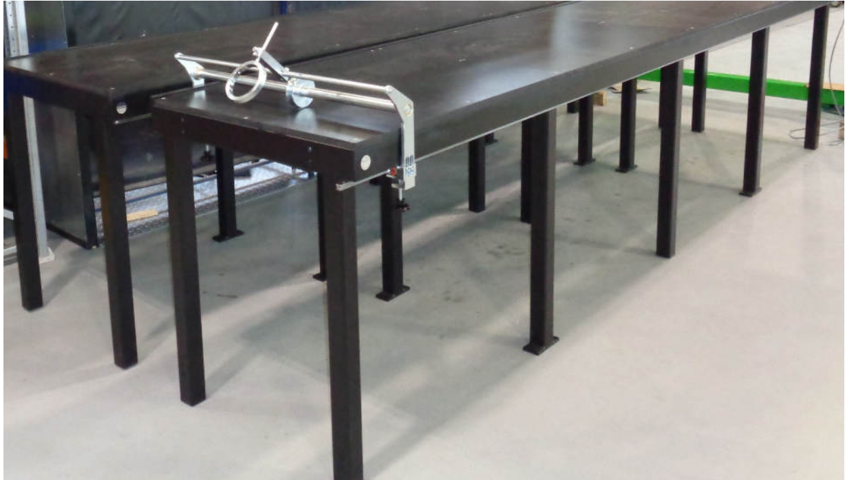
ICE-Trade Work Bench for belt width 800 mm, length 8 m (2 Parts) with side border

For the PVC belting the Work Bench below has a Hiwin Linear Guide for the installation of V-guides on the belt.